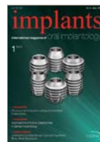
Cover image courtesy of Bicon, www.bicon.com